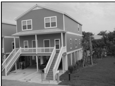
3 Bedroom duplex at Bayside Landing on Big Coppitt Key.

In the Lower Keys, Habitat provides homeownership opportunities for those who have lived in Monroe County at least one year and have a total household income no more than 80% of Monroe County's median income.