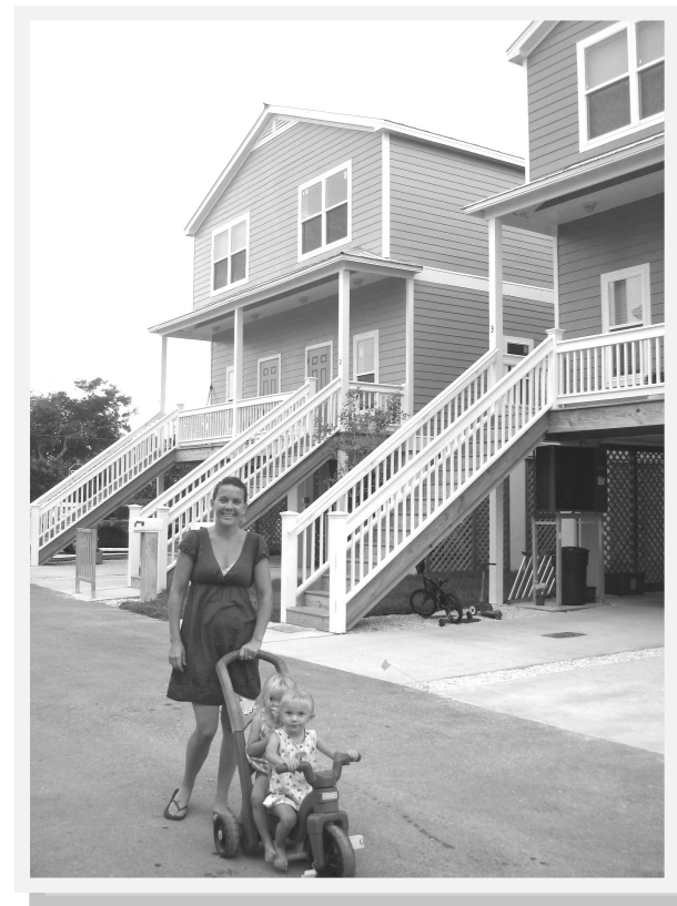
Habitat's Bayside Landing, Big Coppitt Key